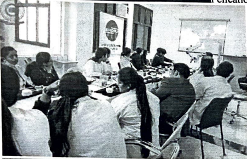
Hands-on workshop being conducted